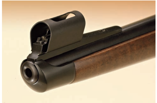
For iron-sight die-hards, a Williams-type rear sight and hooded bead front grace the barrel.

way forward allows the gun to fire. Mid-position allows you to work the bolt to add or remove ammunition with the sear blocked. All the way back locks both the bolt and sear.