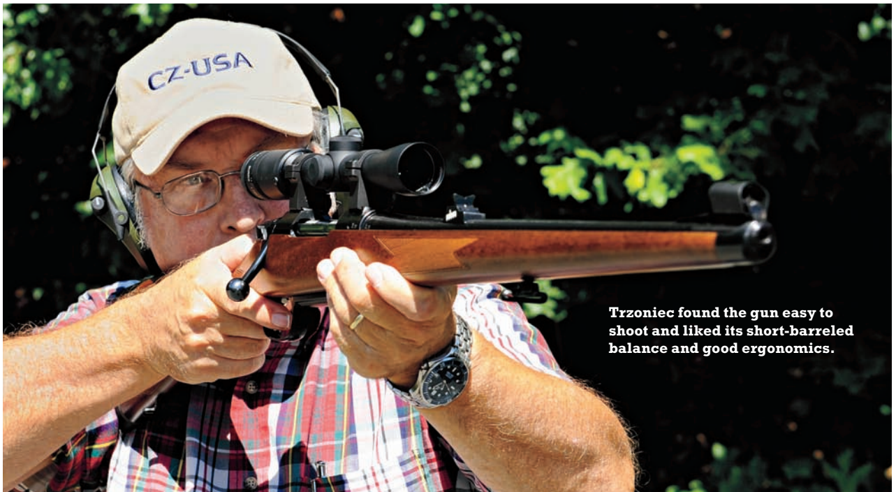
Trzoniec found the gun easy to shoot and liked its short-barreled balance and good ergonomics.

At the range, the gun proved its mettle, shooting under an inch with Remington's 80-grain Power-Lokt hollowpoint. As far as I'm concerned, the rifle is worthy of any hunting chore the New England countryside I call home can throw at it. 🍷