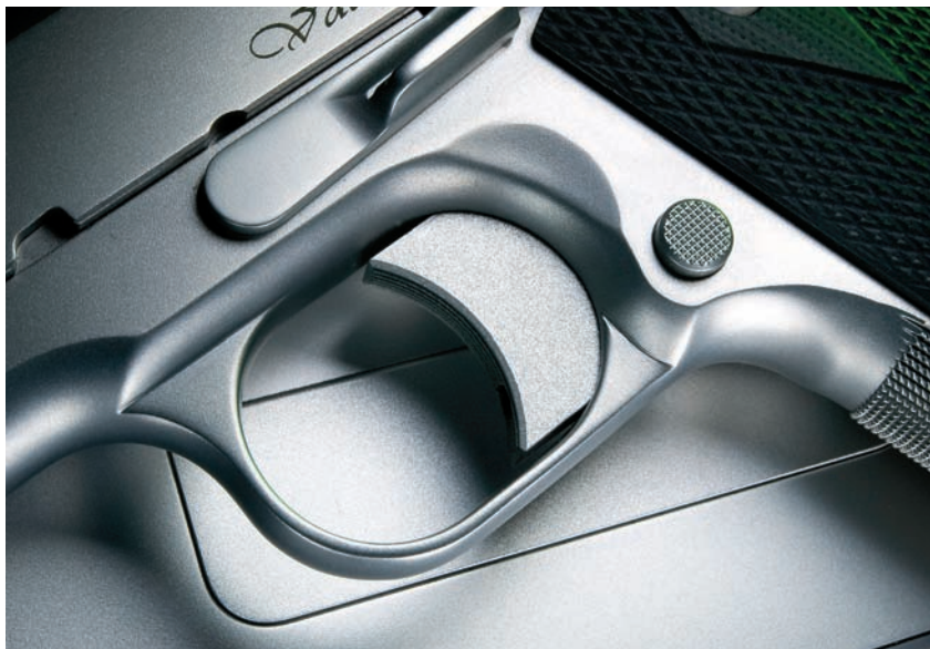
The match trigger system is subtle and only appreciated when pulled.

THE SLIM GRIPS FEEL GOOD, AND THE COLOR IS AN ATTRACTIVE COMPLEMENT TO THE MATTE-BLACK PISTOL.