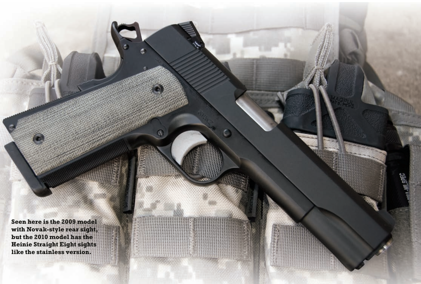
Seen here is the 2009 model with Novak-style rear sight, but the 2010 model has the Heinie Straight Eight sights like the stainless version.

The Valor's five-inch slide is also forged. It has no front cocking