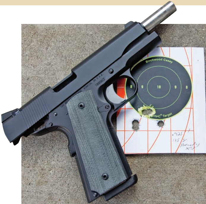
The Valor punched this .93-inch, 25-yard five-shot group with Hornady 185-grain factory ammo. It demonstrates the Valor's tackdriving potential.

IT OBVIOUSLY HAD A GREAT DEAL OF HAND-FITTING, WHICH IS SOMETHING I WOULD EXPECT TO FIND ON A 1911 COSTING A LOT MORE.