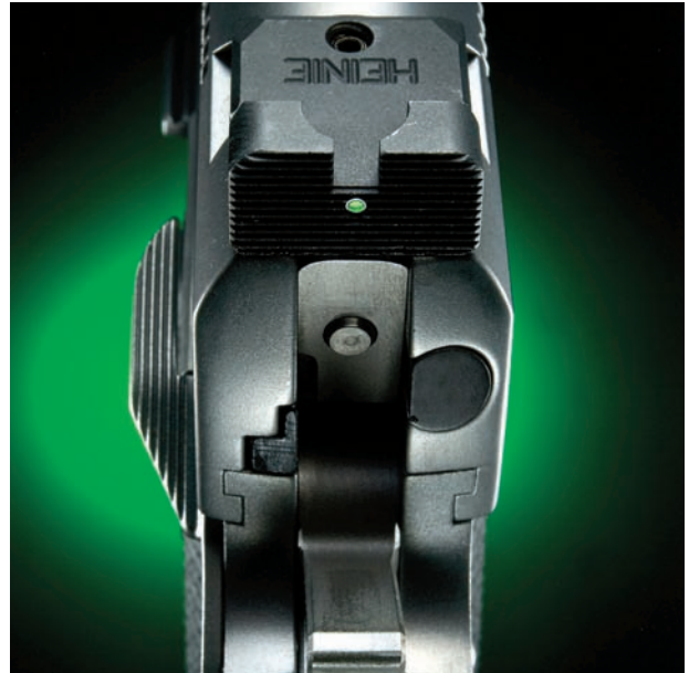
The Heinie Straight Eight sight is preferred over three dots by many contemporary pistol shooters.