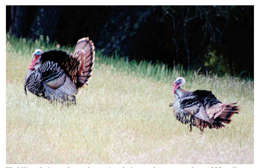
Waddling their wattles and strutting their snoods, two members of M. gallopavo venture across open ground. A load of Federal #7 heavy steel would be fine, but what if a snort of hogs burst from the treeline? Having a Fusion .243 in the lower barrel might be just the ticket.

As things turned out, we were not able to nail a hog on that hunt with the 802 Combo, but I know that in the future the opportunity will present itself. If you like the idea of having both a shotgun and a rifle in one package, then the CZ-Brno Model 802 is worth checking out. With its 12-gauge shotgun barrel over your choice of .243 Winchester, .308 Winchester or .30-'06 rifle chamberings, it's a well-made and versatile hunting arm that just might give you that little extra advantage you've been searching for.