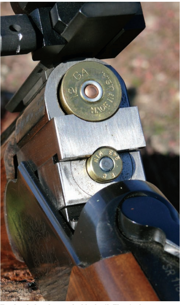
Top for chukar, bottom for blacktail. The single extractor services both chambers.