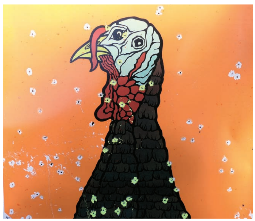
Spalling targets are a great aid in determining exactly where your shotgun is patterning.

The CZ-Brno 802 Combo is quick and handy. Measuring just 41 inches from muzzles to butt, it features 23½-inch barrels and tips the scales at just seven pounds. The gun's metalwork is nicely finished and blued, and the butt and fore-end stocks are nicely figured walnut with hand-cut checkering. The buttstock also features a stylish, sculpted cheekpiece and a black rubber recoil pad. Sling swivels are fitted to the underside of the buttstock and to the bottom rifle barrel via a barrelband, in