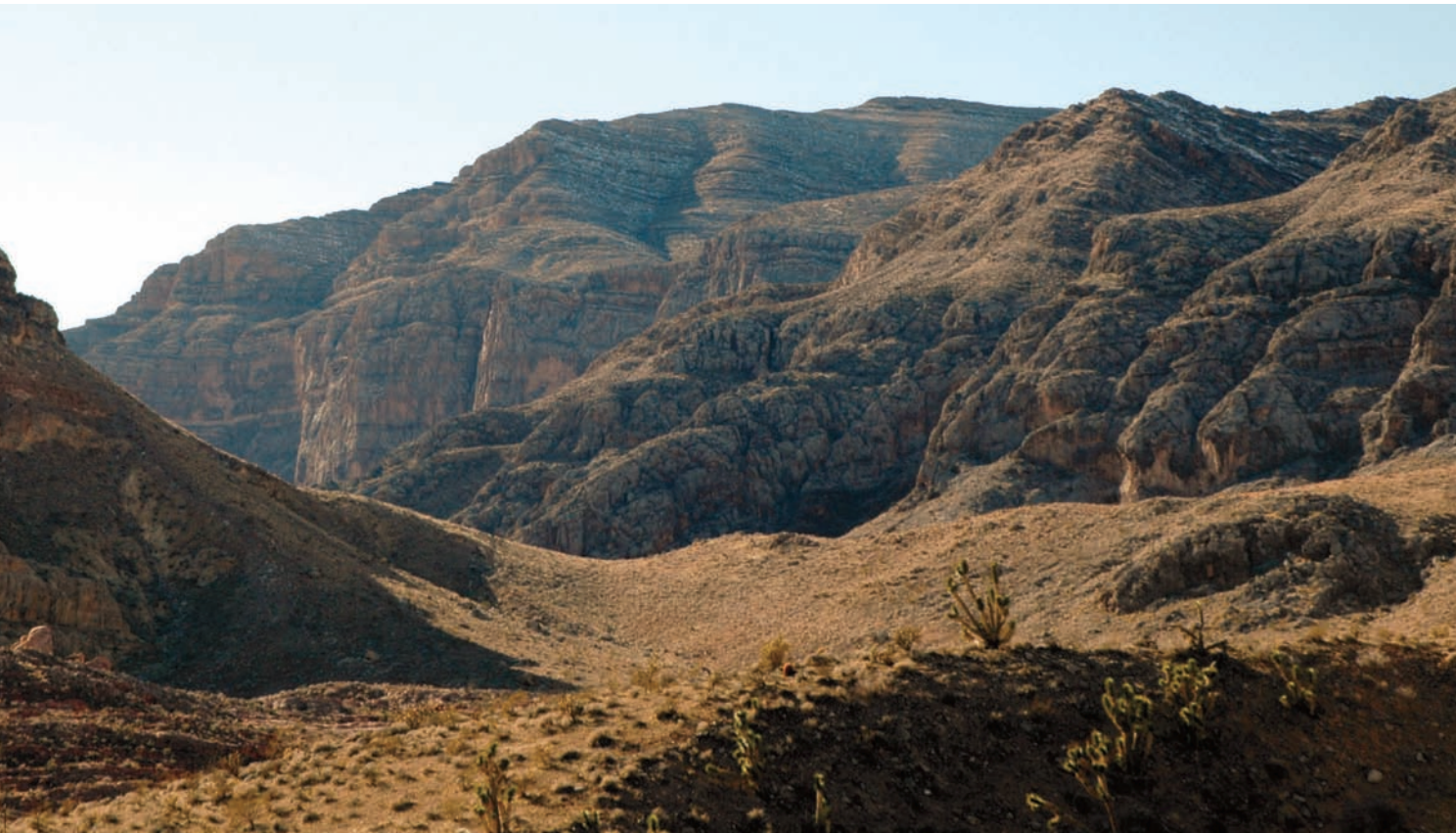
Arizona's arid Unit 13 has high mesas broken with deep valleys—and mountains besides.

drought was reducing horn mass; it had been years since a Boone & Crockett ram had been taken in this area. This gave me realistic expectations. In total, we located six or eight Class 4 rams. The best of these was a ram that seemed to have very heavy bases, with a distinctive wide flare and broomed horns. He became our primary target.