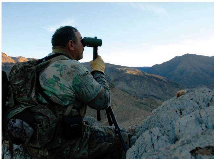
High-quality, high-powered optics are a must for desert bighorns. Conducting an extended search through poor optics is asking for a headache.

That is, until he went missing. He was seen three different times, weeks apart, on the same ridge, and then, just before the season, he vanished. We knew this before we started the hunt, which, by mutual agreement, was several days past the season opener. We were in hopes that the three resident tag holders would get in, get their rams and get out (two