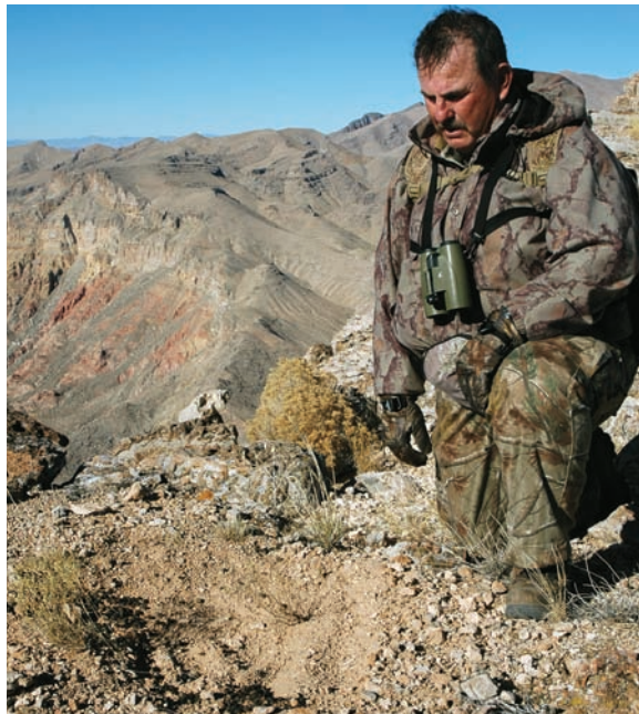
As with many other big-game species, wily desert bighorns like to bed where they can see approaching predators while not being easily seen.

Here we found sheep—multiple groups of ewes and a couple of young rams. And it was from here, just before sundown, that we spotted what seemed to be a good ram up on the skyline. There was no way we could reach him in the hour of light remaining, but it doesn't take sheep as long as it takes us to cover ground. We stayed until dark, hoping he might come down to,