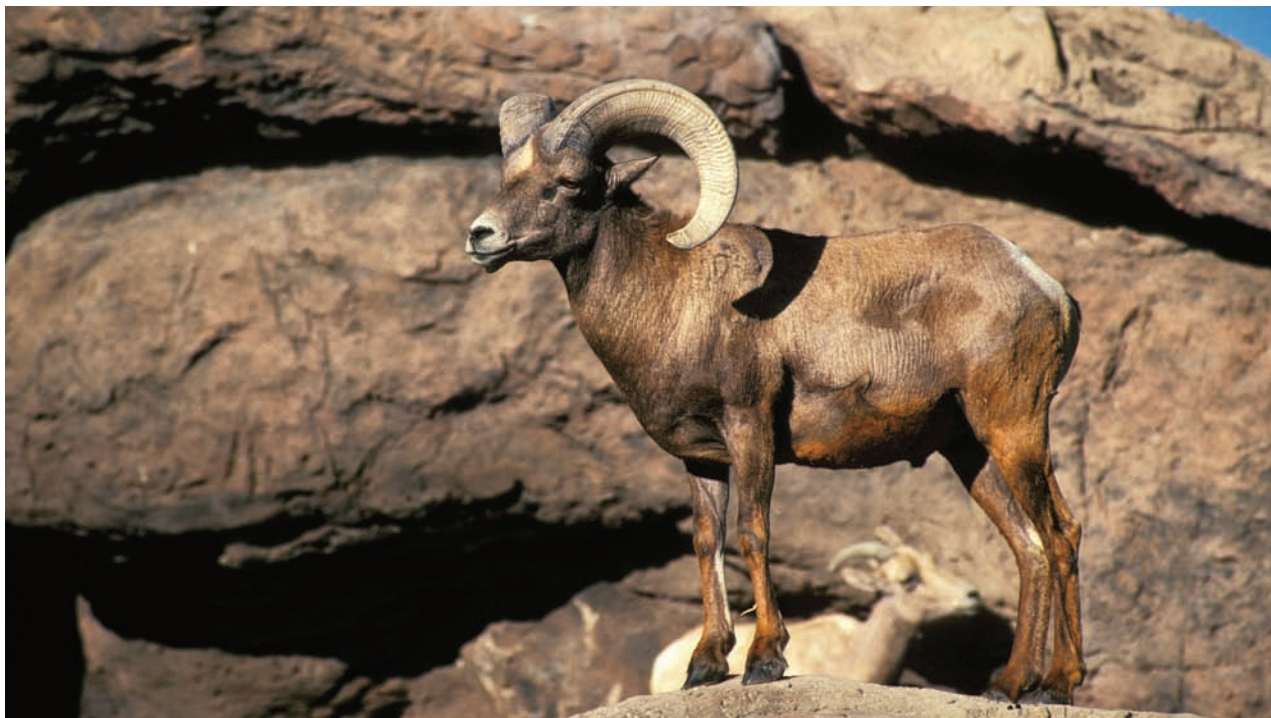
Desert bighorns prize their burly horns as much as the hunters who dream of them. Rams of O. c. nelsoni proudly display their headgear to awe other sheep.

How long does it take to cover 60 yards downhill on an open ridge? We were in dead ground for mere seconds, and when we could see over the lip of that final point there was a dark animal standing amid boulders on the pinnacle, probably not 20 yards from where we'd seen the ram 21 hours before. Binoculars came up, and mine dropped instantly: If this was the same ram, he looked a whole lot better at 250 yards. He had the same conformation, full curl