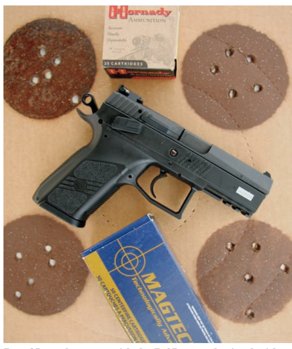
Best 25-yard groups with the P-07 were obtained with Hornady 115- and 124-grain XTP loads and Magtech's 124-grain JHPs. Functioning was excellent with everything the author had on hand.

If we aimed for the top edge of the plates, we could mow them down about as fast with the CZ as we could with our own carry guns, thanks to its light recoil and stellar ergonomics. Reloads were fast and easy, thanks to the oversize magazine release and the taper of the double-column magazine.