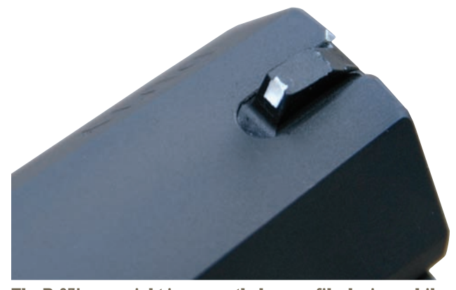
The P-07's rear sight is a smooth, low-profile design, while the front is mounted in a unique forward-facing dovetail.