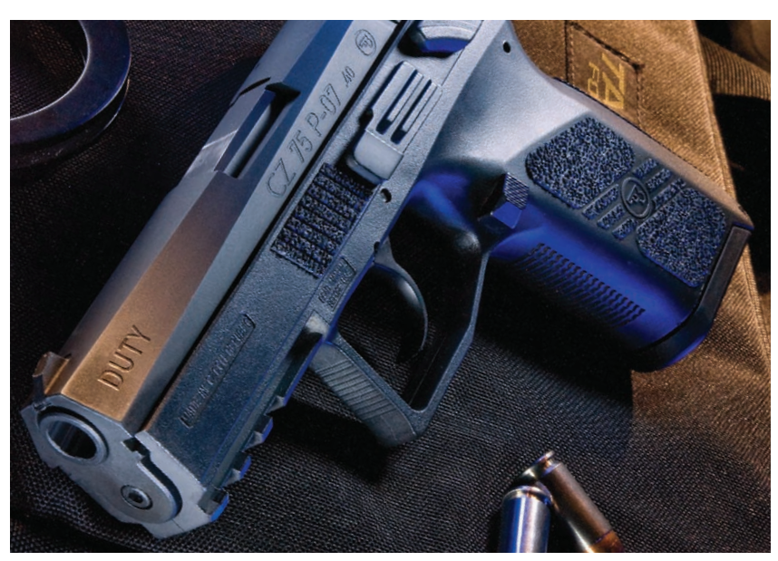
The new pistol's grip angle feels and points great. The molded-in texturing really locks the pistol in place during rapid-fire strings.

new pistol's trigger, I went to the 25-yard line to do my accuracy and chronograph work. I fired from a sandbag rest at three-inch Shoot-N-C targets. Once again, the gun hit low, but the windage was perfect and the groups were pretty good for a polymer-frame production gun, with all but one load averaging under three inches for five five-shot groups.