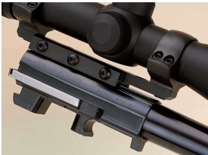
The metalwork was precisely machined. The light bar is on the right side of the Effect's strong, dual-action manual ejector.